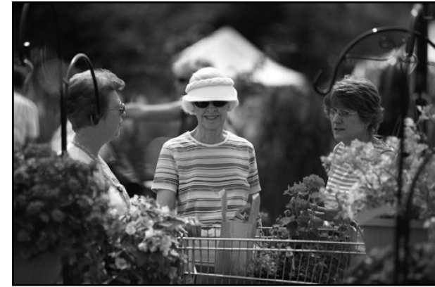
LADIES DOING SOME SHOPPING AT A PAST KLEHM GARDEN FAIR EXTRAVAGANZA.