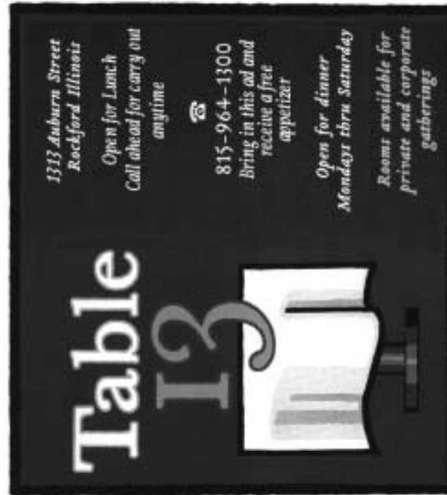
Table 13. Another establishment that makes the North End a nice place to be.