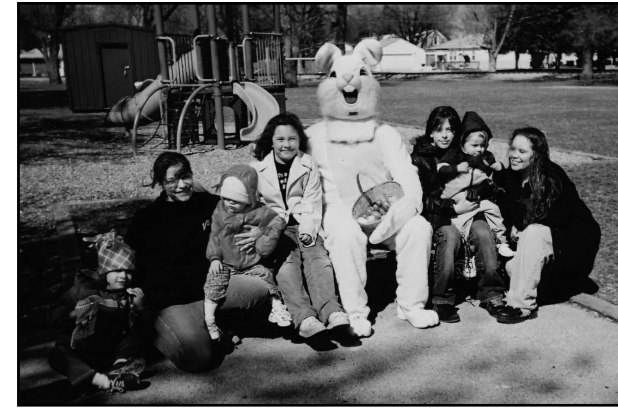
THE EASTER BUNNY RELAXES WITH FRIENDS AT THE EASTER EGG HUNT AT HUFFMAN PARK, SATURDAY APRIL 8.

Each household is furnished with a recycling bin. Aluminum and tin cans, glass jars and bottles, aerosol cans, coded plastics #1--#7 and 6 and 12 pack rings will be accepted. All containers should be rinsed, caps removed and placed loosely in a bin. If you have excess recyclables, they may be placed in a paper bag and set next to the bin. Newspapers should be placed in a paper bag and set on top of the bin. Paper, magazines and phone books should be placed in a paper bag and set next to the bin. Cardboard and paperboard must be flattened and bundled with string or twine, not wire. The bundles should be no larger than two feet by two feet. These also should be set next to the recycling bin. Recyclables will be collected on your regular garbage day.